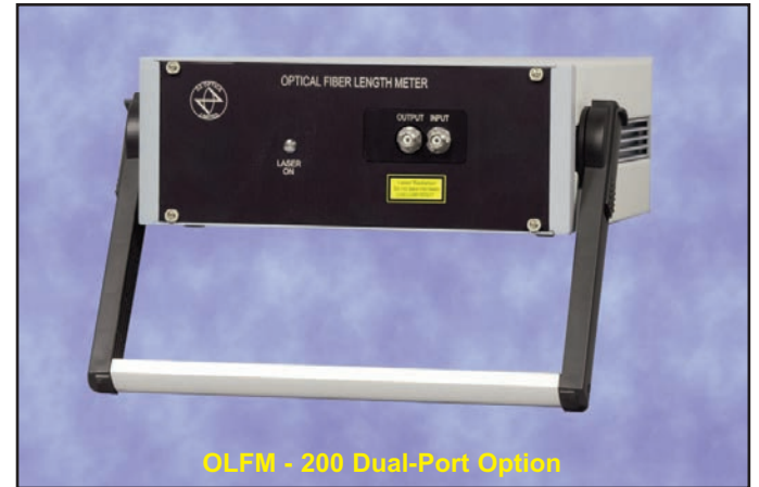
OFLM - 200 Dual-Port Option