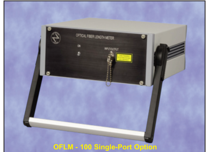
OFLM - 100 Single-Port Option

With resolution and repeatability of less than 2 mm, the OFLM-100 delivers highly accurate optical path length measurements for distances up to 500 m. The system reports and records its measurements to any Windows based personal computer, allowing easy data logging and report writing.