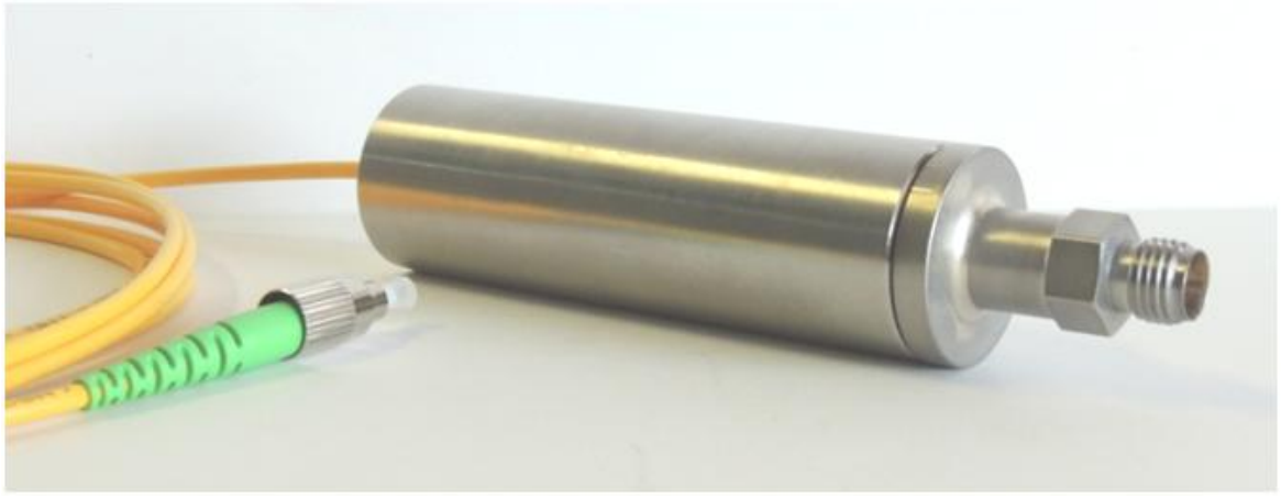
Figure 1: Fibre Pressure Sensor OEFPS-200 and 300.

Fiber pressure sensors are used to measure pressure in air, gas, water, liquid or other mediums. An optional temperature sensor can be built in with pressure sensor for monitoring both pressure and temperature at the same time. The FBG is not in physical contact with the medium in which the pressure should be measured.