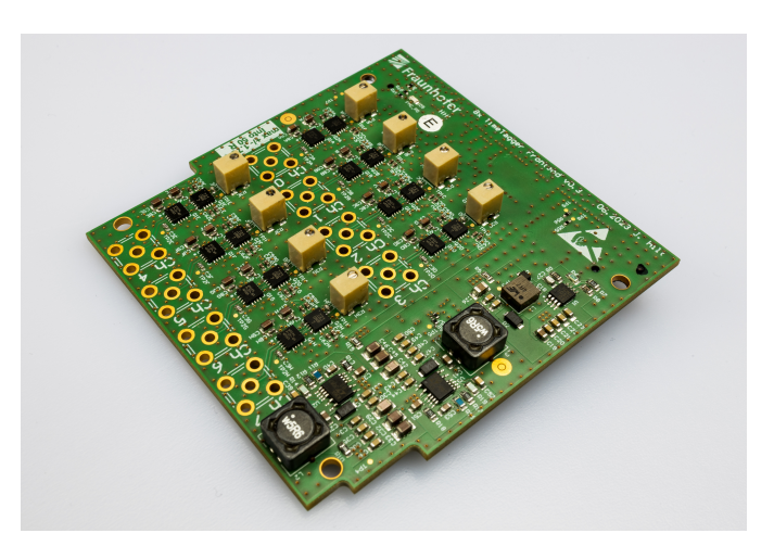
Eight Channel Timetagger FMC Card