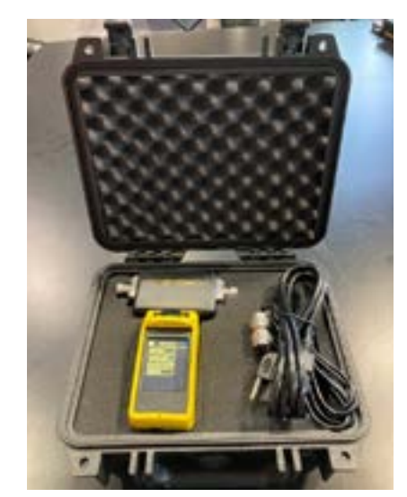
YellowFrog-Pro™ includes rugged transport case, PC software, power transformer and barrel plug