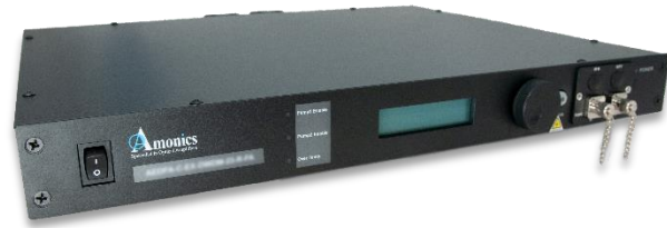
1U Rackmount Casing