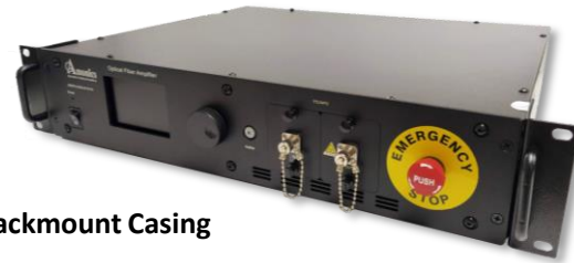
2U Rackmount Casing