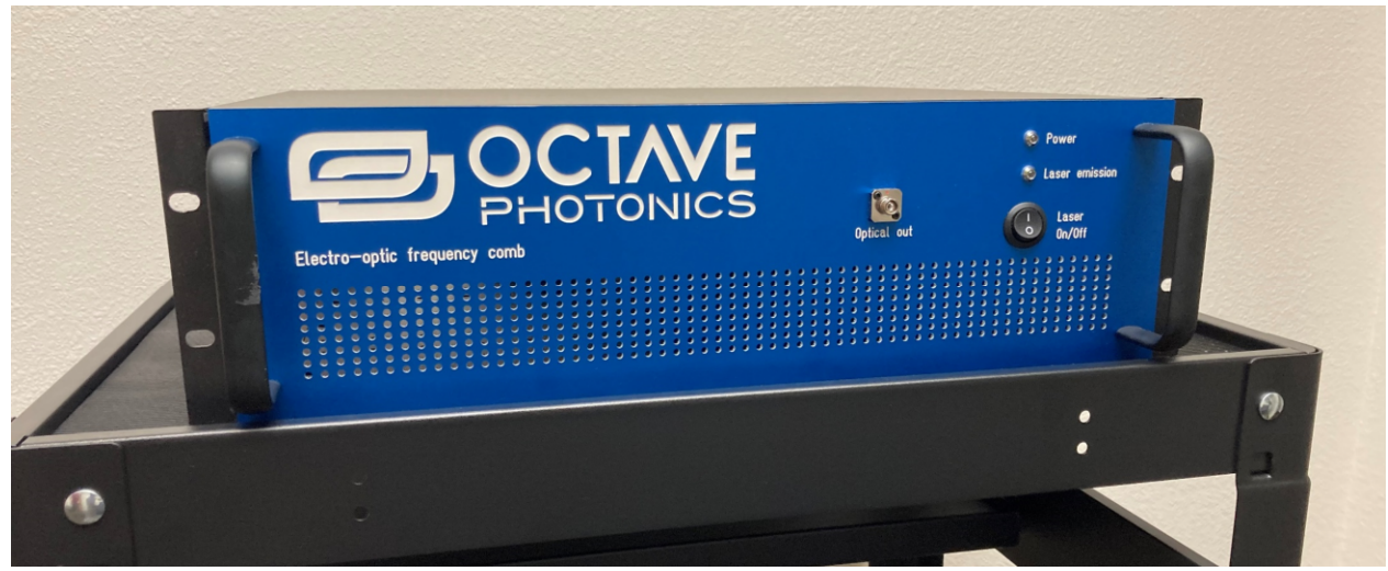
19-inch-rack-mount Base EO comb.

Summary: Electro-optic laser frequency combs (EO Combs) from Octave Photonics provide a reliable method for generating femtosecond frequency combs at repetition rates between 5 and 30 GHz. Octave Photonics specializes in building EO combs with ultra-low phase noise, octave-spanning bandwidth, and femtosecond pulse durations. Applications include spectrograph calibration and dual-comb spectroscopy.