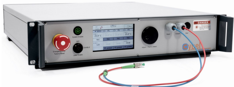
Turn-Key Rack Mount Benchtop